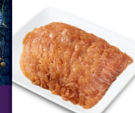
COLD SMOKED SALMON FILLET, SLICES