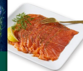
GRAVAD RAINBOW TROUT FILLET, SLICES