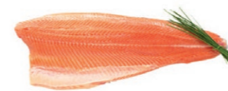
RAINBOW TROUT FILLET Trim-C