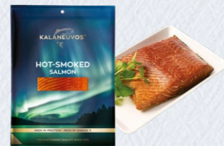
HOT-SMOKED RAINBOW TROUT FILLET, piece VAC ca. 400 g