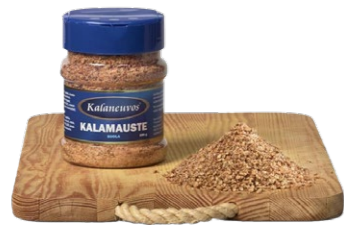
FISH SPICE Original, 180 g jar