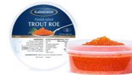
ROE from trout Frozen 250 g