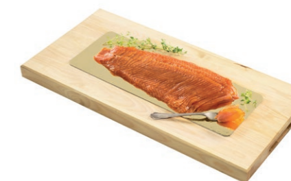
COLD-SMOKED RAINBOW TROUT FILLET, SLICES