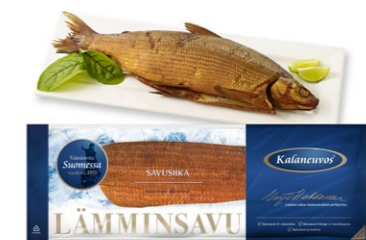
HOT-SMOKED WHITEFISH VAC ca. 700–900 g