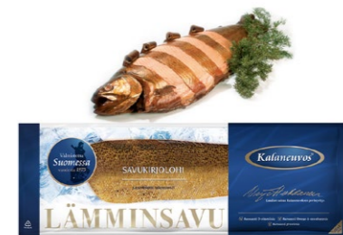
HOT-SMOKED RAINBOW TROUT, whole VAC ca. 800–1400 g