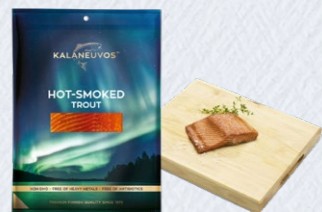
HOT-SMOKED RAINBOW TROUT FILLET, piece VAC ca. 250 g

Kalaneuvos' hot-smoked products, such as smoked rainbow trout fillets and hot-smoked salmon, are the company's best-known product category. Smoking fish is a strong tradition in the Nordic countries, and Kalaneuvos is the market leader in Finland thanks to first-class raw materials, consistent quality and a recognisable flavour.