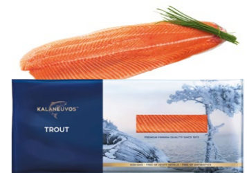
RAINBOW TROUT FILLET Trim-E