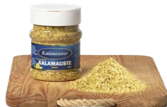
FISH SPICE with lemon, 140 g jar