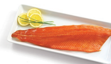
COLD-SMOKED RAINBOW TROUT FILLET