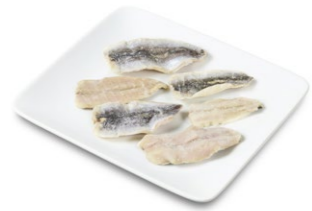
BALTIC HERRING FILLET 15–25 g 1 kg, MSC, frozen

Kalaneuvos factory production plant in Sastamala is MSC and ASC certified. All our Baltic Herring products are MSC-certified.