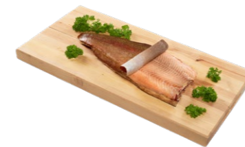
HOT-SMOKED RAINBOW TROUT DOUBLE FILLET VAC ca. 1350 g

Hot-smoked fish is versatile and suitable on bread, in salads or served with potatoes. The range includes whole fish, fillets, buffer-sliced fillets and double fillets. The intensity of the smoky flavour varies depending on the product: whole fish has a milder flavour, while fillets are slightly stronger.