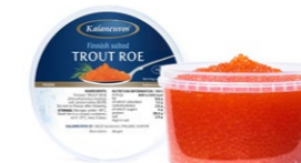
ROE from trout Fresh and frozen 500 g