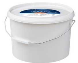
ROE from trout Fresh 10 kg

Fresh trout roe only during the season November-January