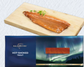
HOT-SMOKED RAINBOW TROUT FILLET VAC ca. 600–800 g

Hot-smoked fish is versatile and suitable on bread, in salads or served with potatoes. The range includes whole fish, fillets, buffer-sliced fillets and double fillets. The intensity of the smoky flavour varies depending on the product: whole fish has a milder flavour, while fillets are slightly stronger.