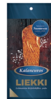
FLAMED RAINBOW TROUT FILLET, piece 150 g