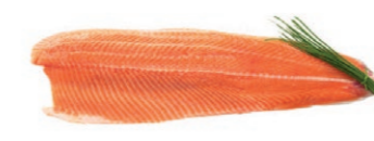
RAINBOW TROUT FILLET Trim-D