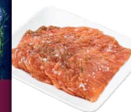
GRAVAD SALMON FILLET, SLICES