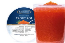
ROE from trout Fresh 1 kg