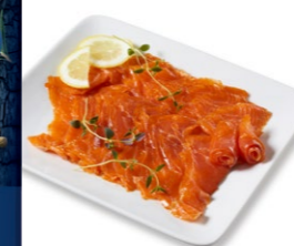
COLD-SMOKED RAINBOW TROUT FILLET, SLICES