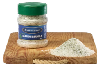
SEA SALT SPICE with dill, 200 g jar